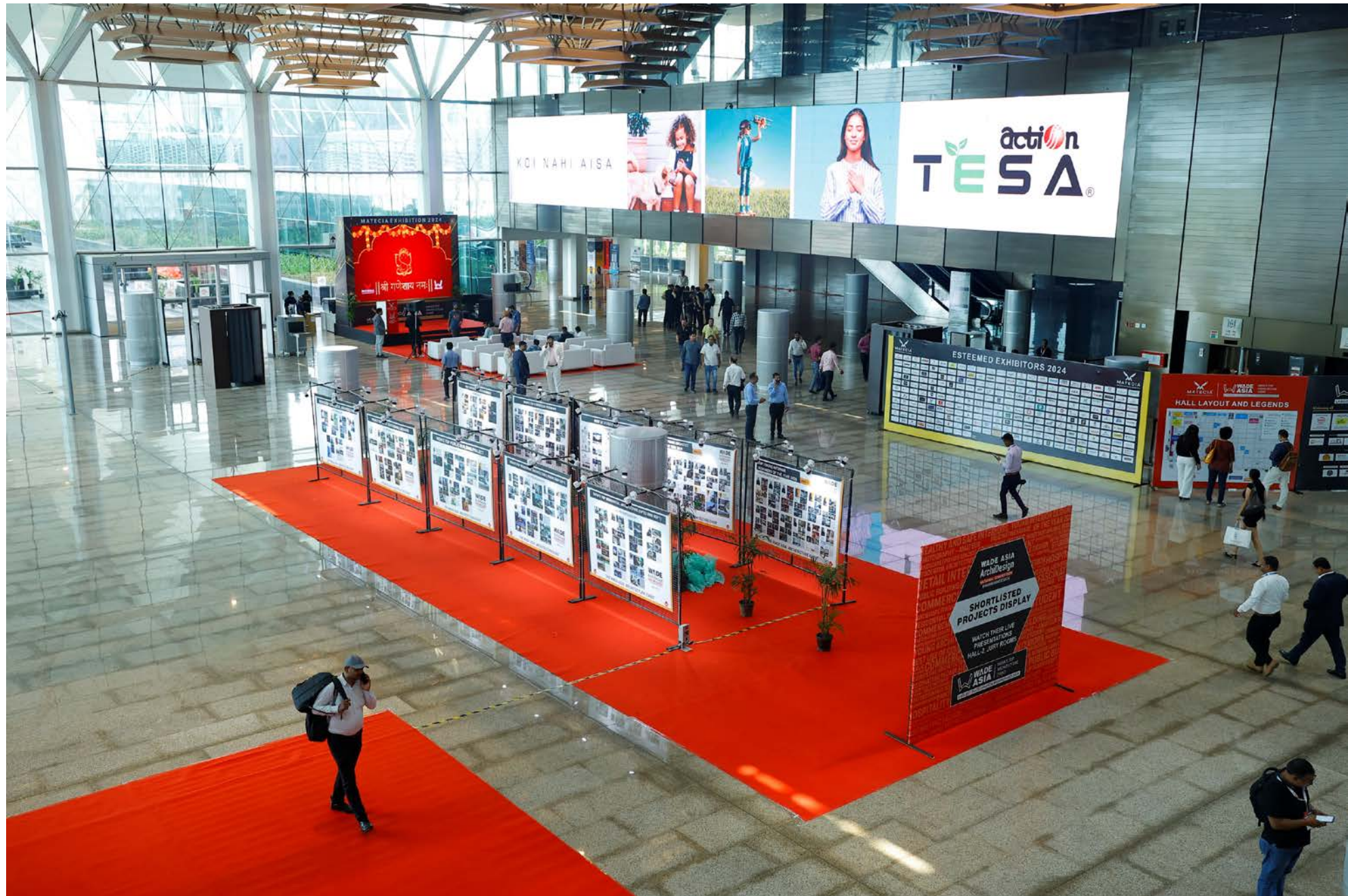
WADE ASIA AWARD 2024